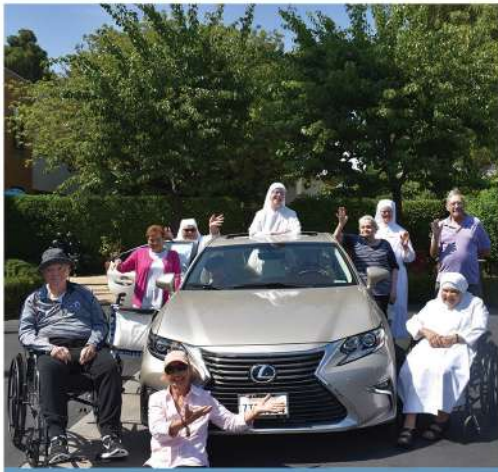
Graciously donated to the Little Sisters of the Poor