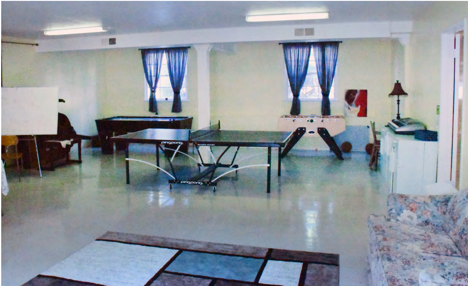
Below: The second room below the Korean church previously used as a youth game and meeting room.