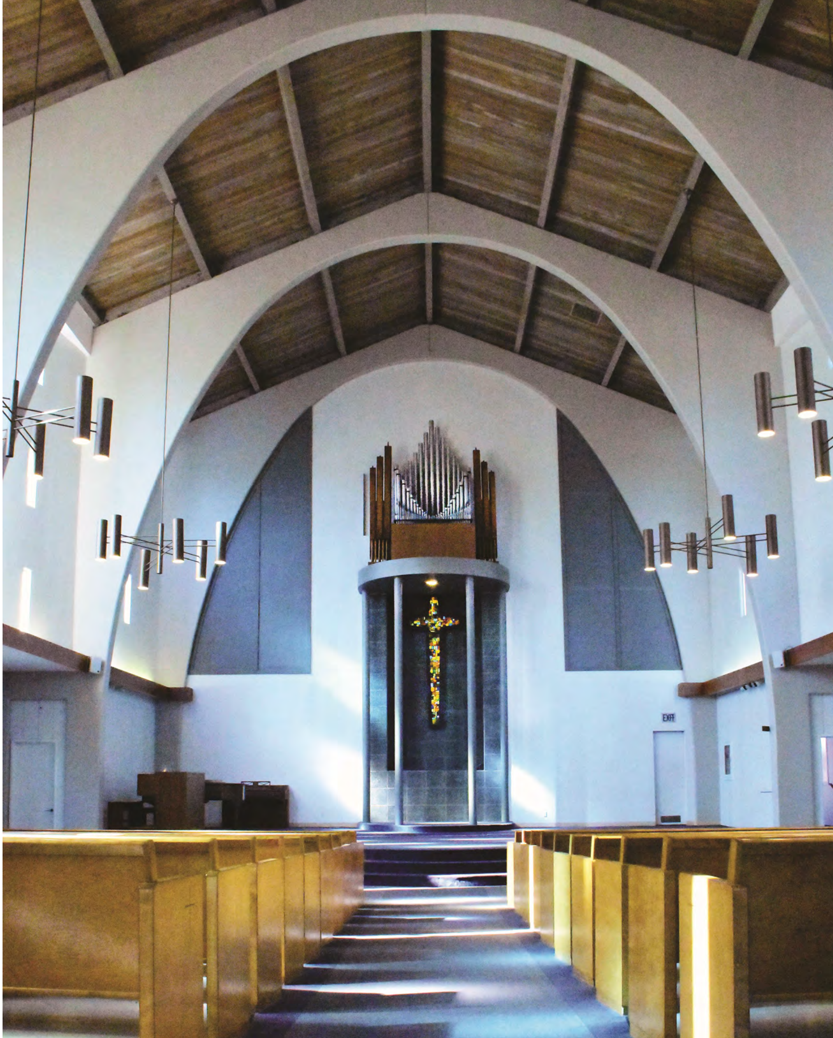
Interior view of new church.