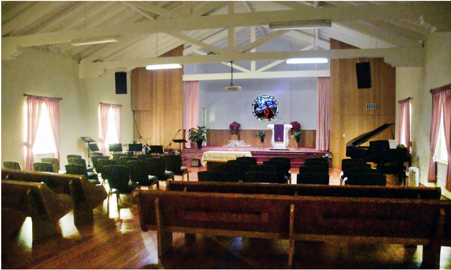
Above: Chapel inside the Korean Church.