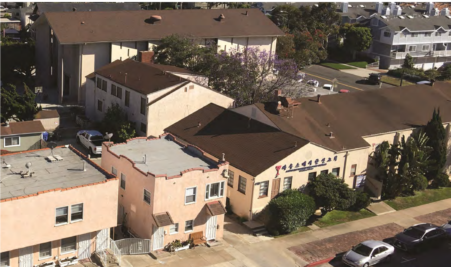
Above: Top to bottom: New church, Education building, Korean Church. The two apartment buildings in bottom left are not included in purchased property. Below: One of two rooms below the Korean Church previously used as a lunchroom.