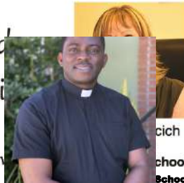
St. James Elementary School TK-8th Grade 4625 Garnet Street Torrance, CA 90503 310.371.0416 Office Hours 7:30 am - 3:30 pm

'Train the young in the way they should go; even when old, they will not swerve from it' Proverbs 22:6