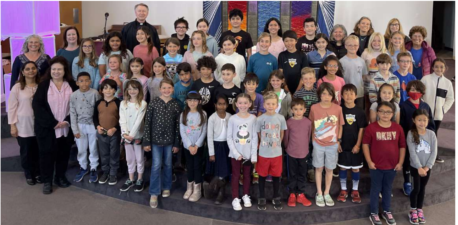
Children in our Religious Education Program received their new Faith Formation Passports at our Closing Celebrations this week.