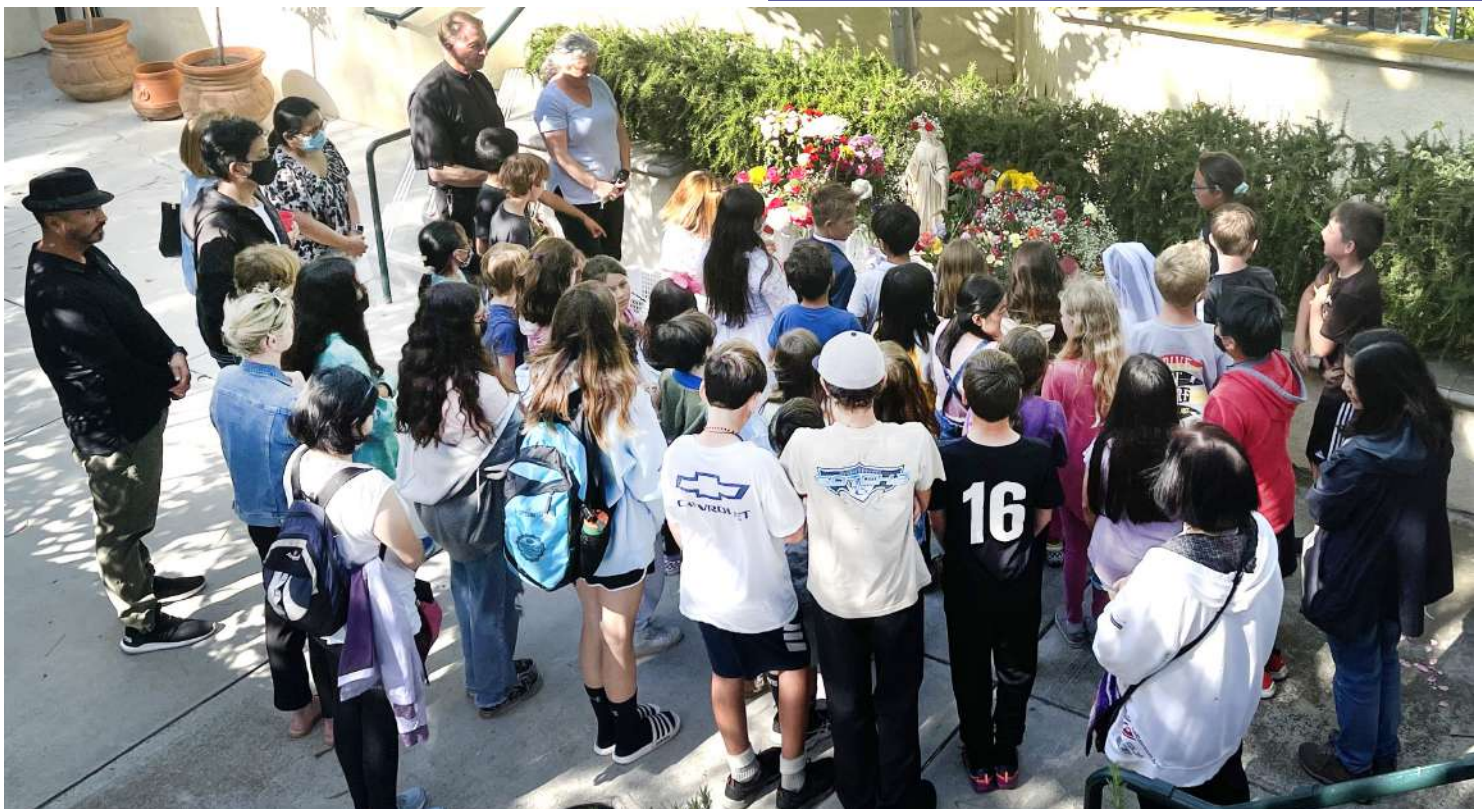
Religious Education Wednesday Group Students celebrate May Crowning of Mary