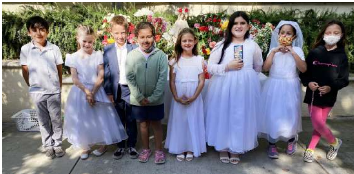
Religious Education First Holy Communion students Celebrate May Crowning