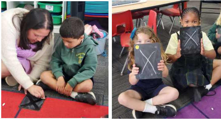
Learning the alphabet - today's letter 'X'